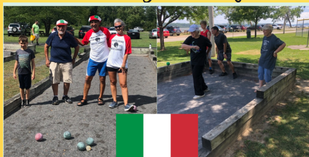
Bocce Day at Robert Post Park

UCIAF Italian Bocce Picnic is Sunday August 6th. Bring your family and friends. Bring some new members. See our website UCIAF.org for more information