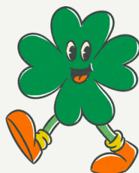
St. Patrick's Day Parade